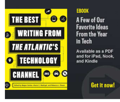
Copyright 2013 The Atlantic Monthly Group. CDN powered by Edgecast Networks. Insights powered by Parsely.