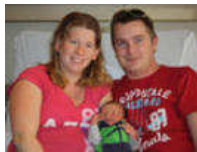
Mom describes roadside birth