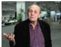
Americans more accepting of sex scandals