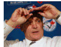
Blue Jays hire new manager