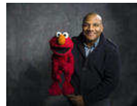
Elmo actor resigns from Sesame Street