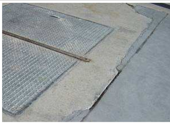
near rink changeroom