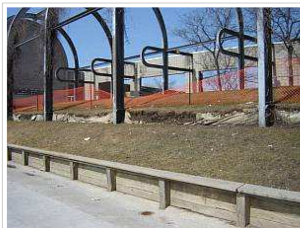
hillside with boards removed

With the landscaping it's important to keep in mind that there needs to be a level place for the donated zamboni tent.