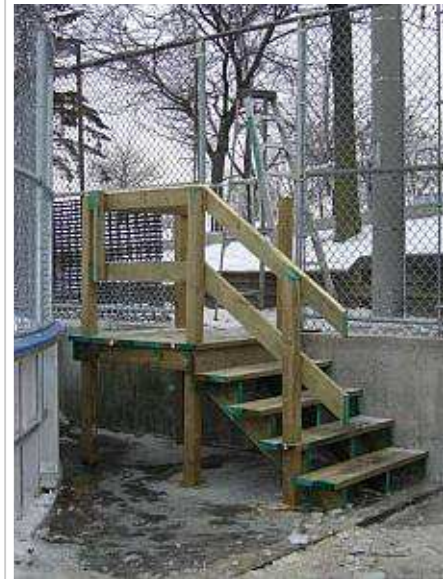
new rink access stairs

It took three days to get the installation of the step-down along the side of the pleasure rink. This change room access slope has now been identified as a problem, and both staff and rink users have slipped and fallen. I heard nothing back. Can you find out whether this problem is being addressed?