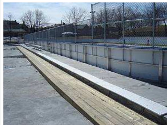
removal of the wooden step-down

This could best be done by restoring the traditional players boxes: