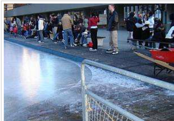
City Hall Rink