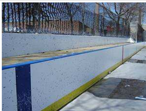
players boxes nailed shut