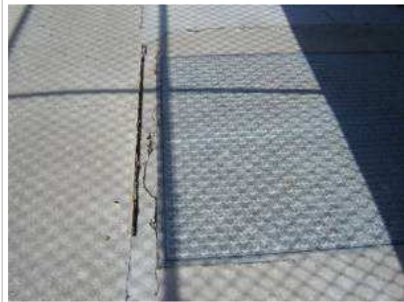
near hockey gate