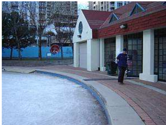
College Park Rink