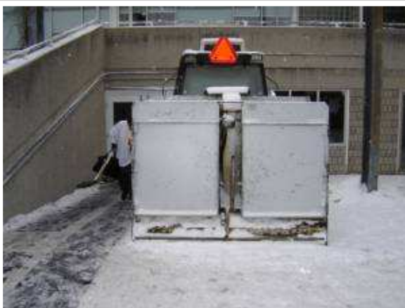
the slanted path needs a railing

here's a copy, as you requested, of the email about the missing railings for the slope between Wallace Rink and the change room. This is what it looks like (in this case a guy is hanging on to the broken tractor using it like a railing instead.