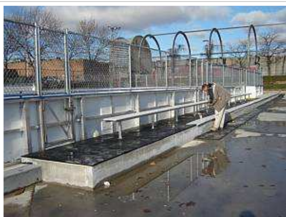
bench appearance at installation

Chris, pardon my lack of grasp of the four cardinal directions. The bench that needs to be restored is not to the south of the pleasure rink, it forms the western edge of the pleasure pad.