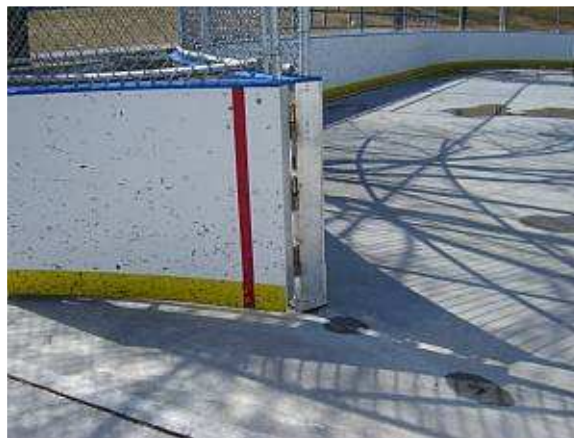
east swing gate installed too high