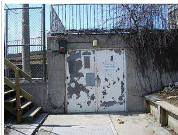
compressor room doors