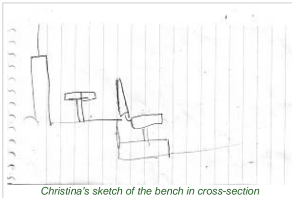
Christina's sketch of the bench in cross-section

I printed off the sketch in your attachment and took it up to Wallace today. Both rink staff and rink users discussed it on-site today. The scale on the drawing doesn't match what we saw up there. Beyond that, both staff and users felt that the bench as sketched in your attachment will make the problem worse. Please don't let them go ahead with it until there's been more thought put in. The priority here is not a last-minute haste (after all those delays!) but getting it right for the rink users.