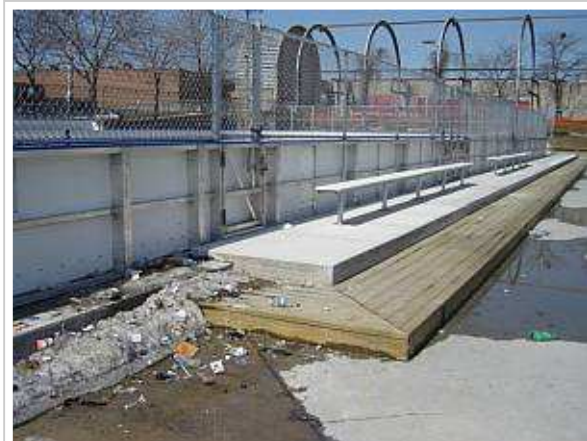
doors in middle section