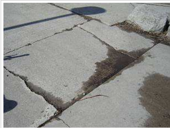
heavy trucks made cracks, lots of trip hazards